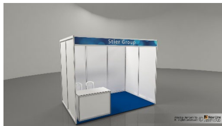
* This Picture is For Illustration Purposes Only.